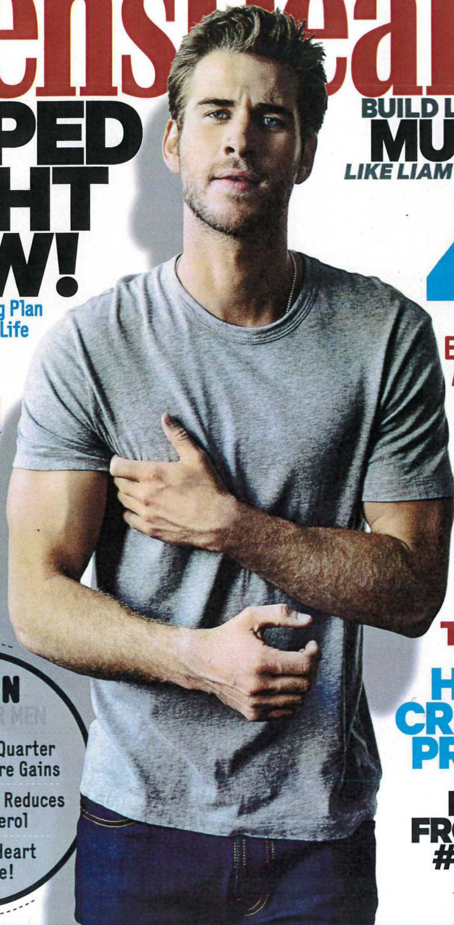
LIAM HEMSWORTH, 25, ACTOR & HOLLYWOOD'S BRAND NEW HEAVYWEIG